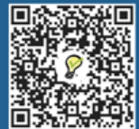
[Next Step: Serve]

signupgenius.com/go/ 904054DADAC2CA7F49- 64618359-feed#/