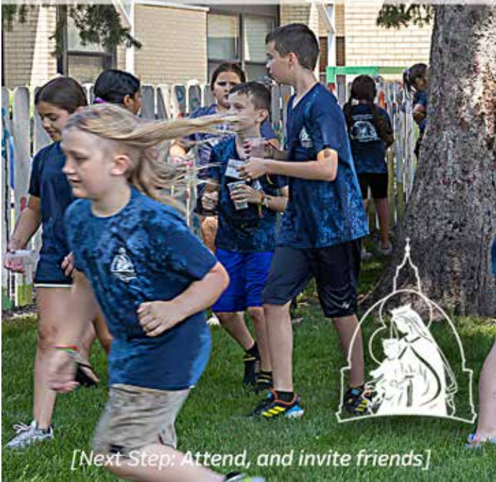
[Next Step: Attend, and invite friends]