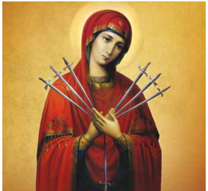
September is dedicated to the Seven Sorrows of Mary.