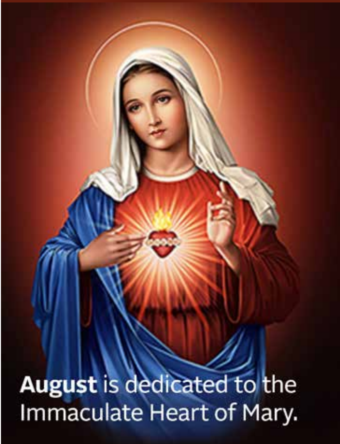
August is dedicated to the Immaculate Heart of Mary.