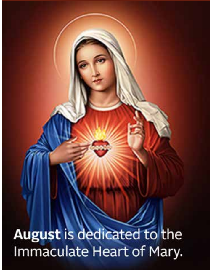
August is dedicated to the Immaculate Heart of Mary.