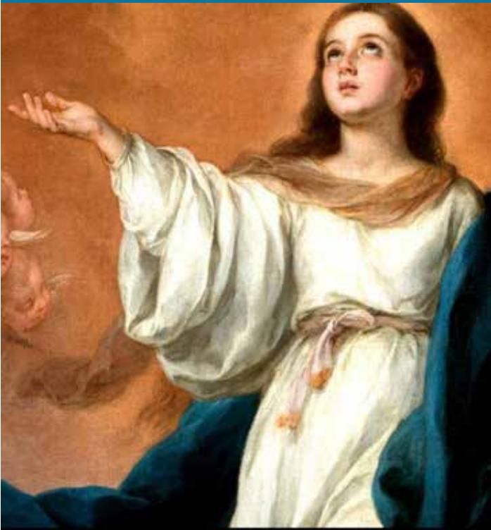
May is dedicated to the Blessed Virgin Mary.