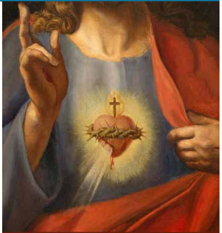
June is dedicated to the Sacred Heart of Jesus.

July is dedicated to the precious blood of Christ.