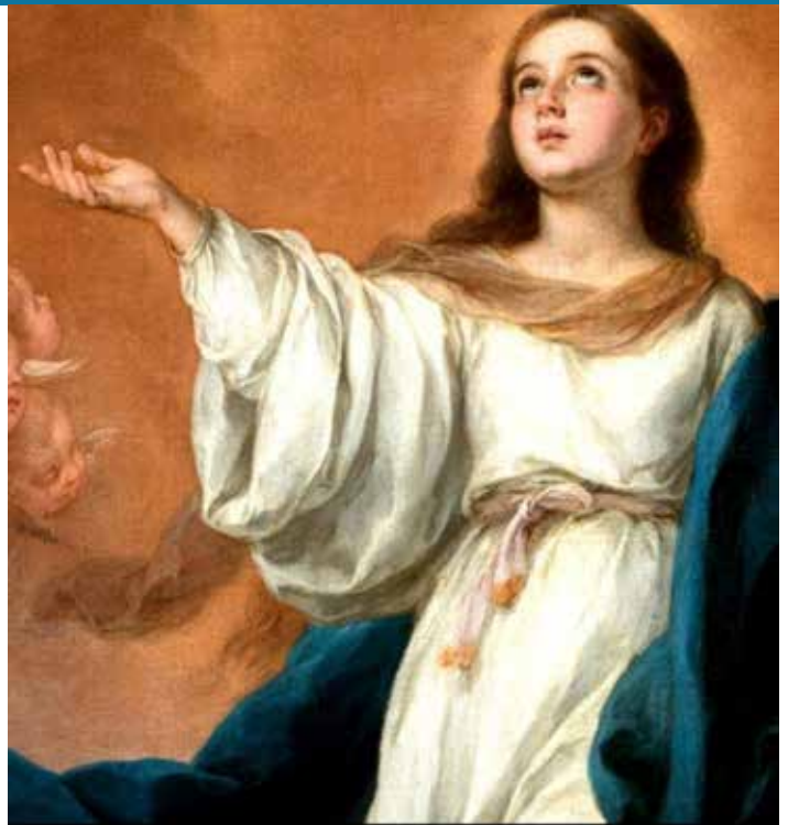
May is dedicated to the Blessed Virgin Mary.