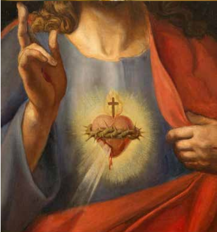
June is dedicated to the Sacred Heart of Jesus.