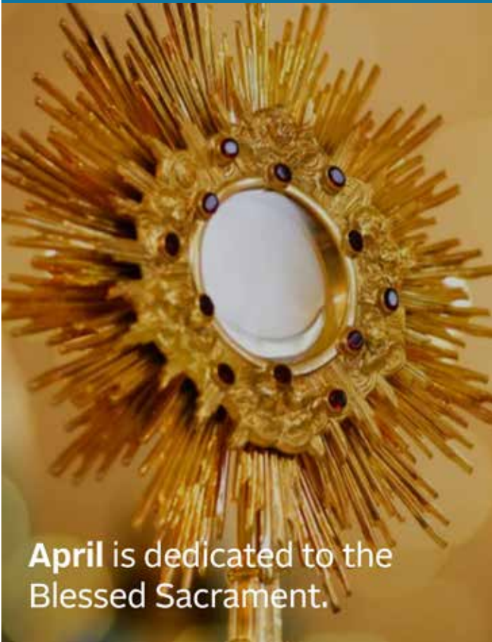
April is dedicated to the Blessed Sacrament.