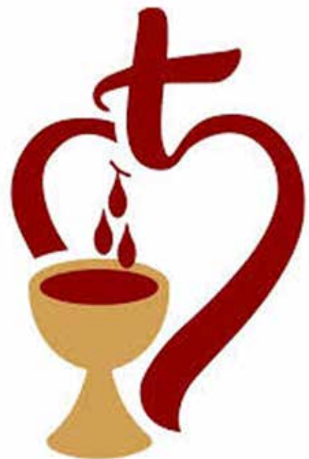
July is dedicated to the precious blood of Christ.