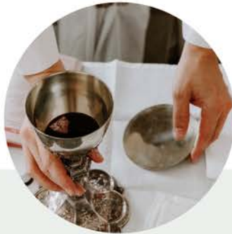
During Mass: Engage