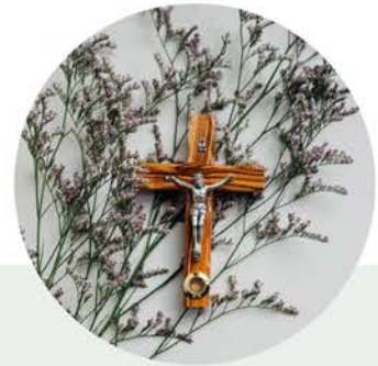
After Mass: Continue

Preparing for Mass as a family is the first step! In this guide, we'll show you how to integrate Mass preparation with activities you already do with your family. You can start small, even just in the car on the way to Mass, trusting God can multiply any effort for His glory. Read more on pages 8-9 for details on preparing for Mass as a family, logistical tips to set you up for success, and a prayer for parents before Mass.