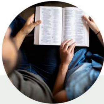
Before Mass: Prepare