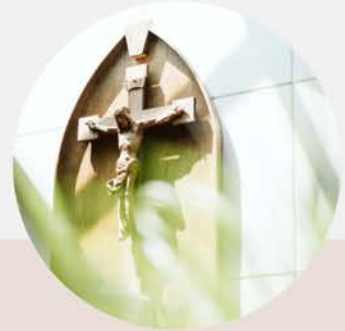
After Mass: Continue

Preparing for Mass as a family is the first step! In this guide, we'll show you how to integrate Mass preparation with activities you already do with your family. You can start small, even just in the car on the way to Mass, trusting God can multiply any effort for His glory! Read more on pages 7-8 for details on preparing for Mass as a family, logistical tips to set you up for success, and a prayer for parents before Mass.