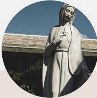
During Mass: Engage