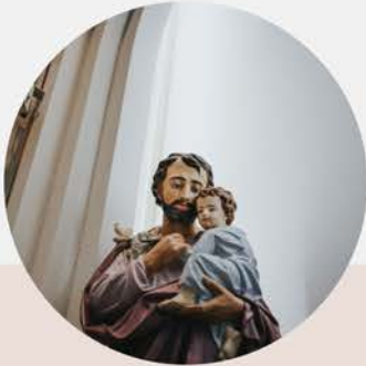
Before Mass: Prepare