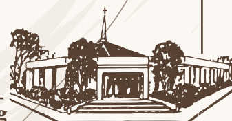
St. Julian Eymard Catholic Parish