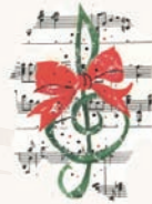
A FESTIVAL OF NINE LESSONS & CAROLS