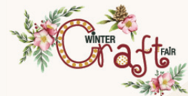
CHRISTMAS CRAFT FAIR supporting School of Religion