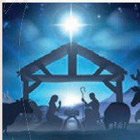
HOLY CHRISTMAS Convenient Mass Times including Midnight Mass