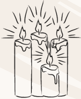
ADVENT Hope, Peace, Joy, Love

Enjoy these opportunities and more for Faith & Fellowship. Comprehensive calendar on our website: www.StJulianEymard.org