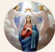
SOLEMNITY OF MARY