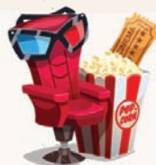
KID'S CHRISTMAS FILM NIGHT hosted by the Youth Ministry