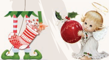
CHRISTMAS ELVES & ANGELS sponsored by the Women's Club