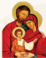
FEAST OF THE HOLY FAMILY